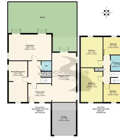
Approx. Gross Internal Floor Area 1716 sq. ft / 159.41 sq. m Illustration for identification purposes only. Measurements are approximate, not to scale. Produced by Quantum Planning